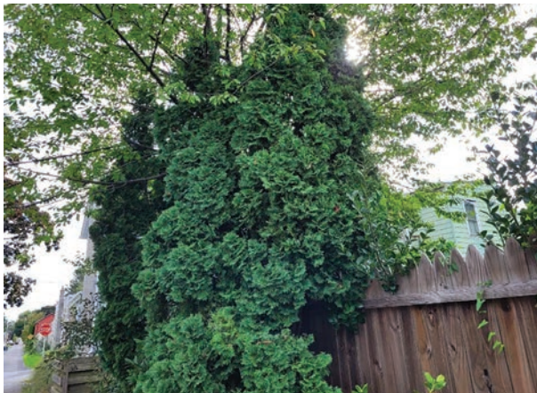
Pictured above is a juniper bush which provides a lot of shade inside of its bushy leaves which mosquitoes use to shield themselves from the sun.

The final draw to your yard may be cool damp areas in general. These areas could be stacked branches or piles of leaves left from the fall or just general rubbish piled up that hasn't been tossed out yet. Even though there isn't any pooling water in some of these locations to lay eggs, they provide enough shade to give the mosquitoes shelter during the hot summer days. The best course of action is to properly store and dispose of anything that can give these pest shelter.