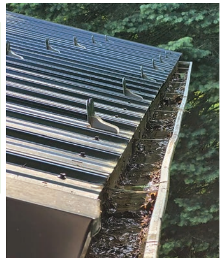
Pictured at right are clogged gutters. The water that stays in these gutters are perfect places for mosquitoes to lay their eggs.

Article provided by Vector Control Weights & Measures