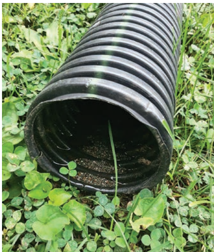
Pictured at left is a corrugated pipe. The ridges in this pipe hold enough water for mosquitoes to lay their eggs in.