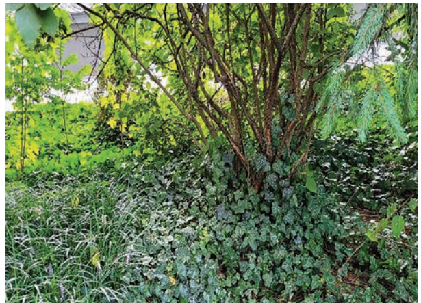
Pictured above is a bunch of ivy. Mosquitoes crawl under their leaves emerging during the cooler parts of the day.